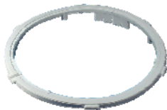
A circular clip situated below the element