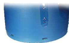
'Details' in the vessel to position the circular clip and element plate